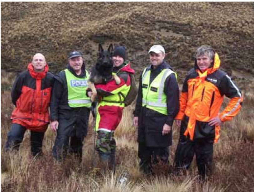
Photo taken at the end of our last track with the assessment team from Police and LandSAR Search Dogs.

Hi All - just back from North Island LandSAR Search Dog assessment at Waiouru, had all seasons from blue sky through to hail and howling cold wind, but after 3 days of assessment we got the tick in the box and we are operational!!